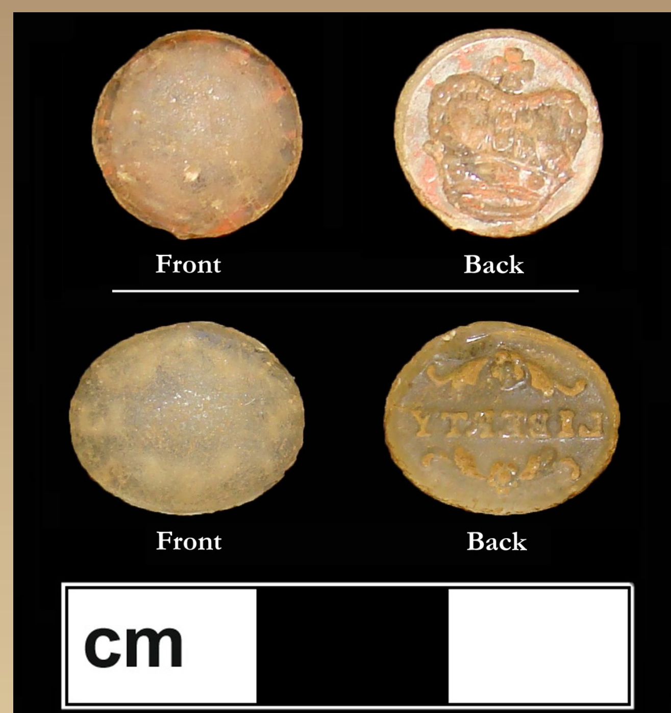
Figure 2: Political buttons with a crown (top), and the word "LIBERTY" in reverse (bottom). Note the red residue on the inset with the crown, which is probably a painted background color. Both insets would have been clear when they were new.

The MAC Lab has a number of these glass insets in its collections, and while many are just meant to be pleasing to the eye, some bear specific messages. For example, a glass inset with a crown motif was recovered at Ft. Frederick, which was built by the British and occupied during the French and Indian War, ca. 1756-1758. The crown is a pretty clear indicator of its owner's loyalty to the English monarchy (Figure 2, Top). Another inset found in Annapolis and probably dating to the American Revolution says "LIBERTY," which goes to show how politics changed in Maryland over a couple of decades (Figure 2, Bottom).