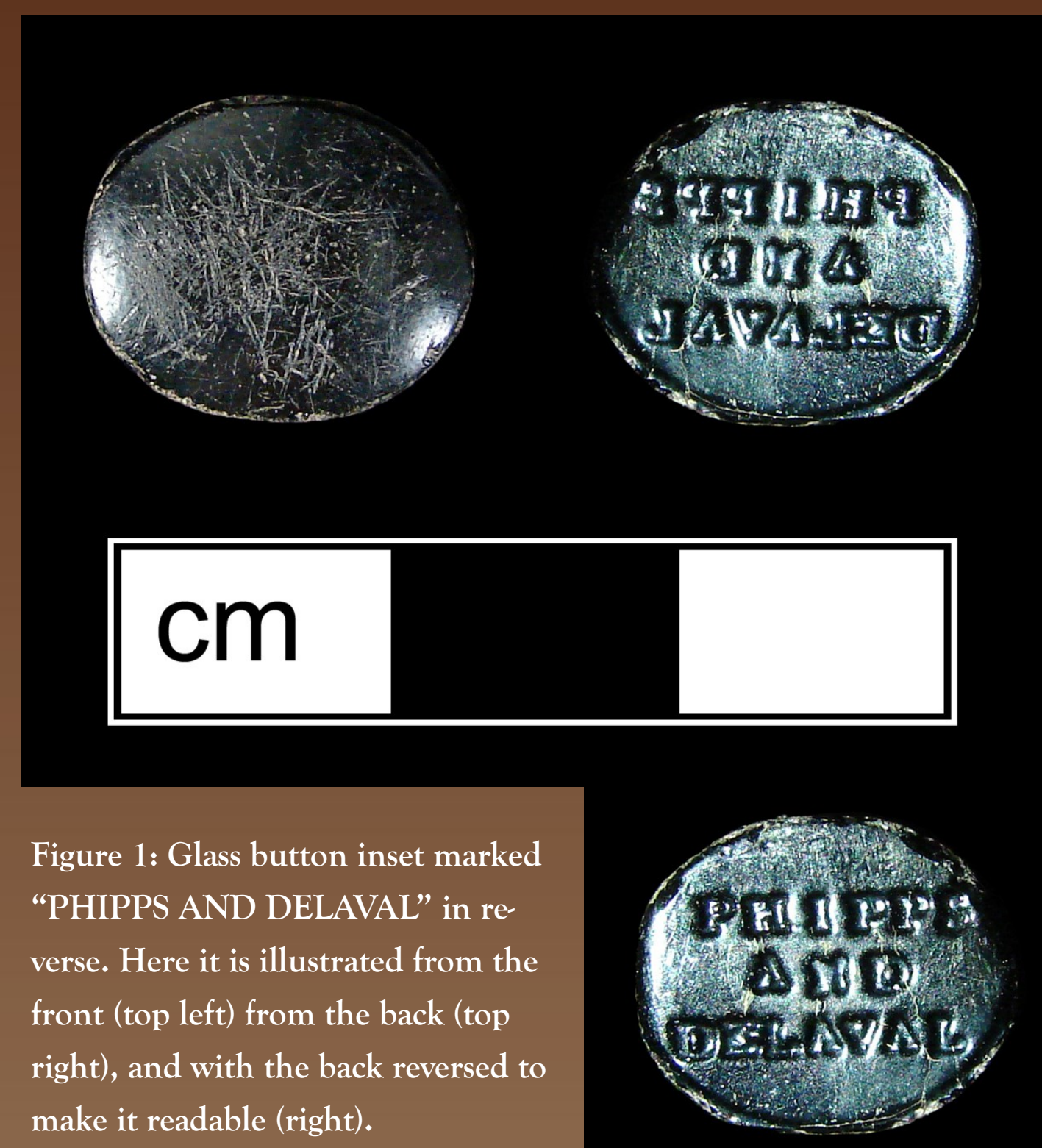
Figure 1: Glass button inset marked "PHIPPS AND DELAVAL" in reverse. Here it is illustrated from the front (top left) from the back (top right), and with the back reversed to make it readable (right).

Lincoln, not Newcastle, and it seems that the 1774 campaign just might possibly have been some kind of "warm up" (ha ha) activity he undertook after returning from a 1773 expedition to the North Pole. His description of the North Pole adventure represents one of the earliest published descriptions of polar bears (Phipps 1774)! Phipps later returned to parliament representing Huntingdon (Wikipedia 15).