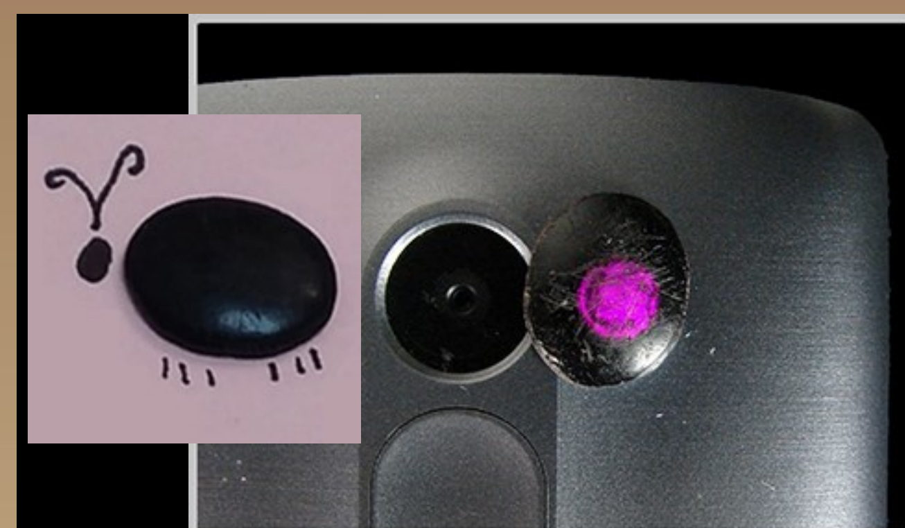
Figure 3: When the Phipps and Delaval inset sits on a post-it, it looks shiny and black. When the inset sits on the intense beam of my cell phone flashlight, though, the light forced through shows that the glass is deep purple.

This is an archaeological conundrum that calls for explanation. See, the glass inset is really, really dark. By that I mean opaque-black dark. Like when-it-sits-on-my-desk-it-looks-like-a-beetle dark. In fact, only the application of a cell phone flashlight app on its highest setting revealed that the glass is purple, not black (Figure 3). Which begs the question, would the names Phipps and Delaval have ever been visible on this button? Was there any reflective foil in the world powerful enough to make those names pop out through the black hole of a color that this inset manifests? Maybe.